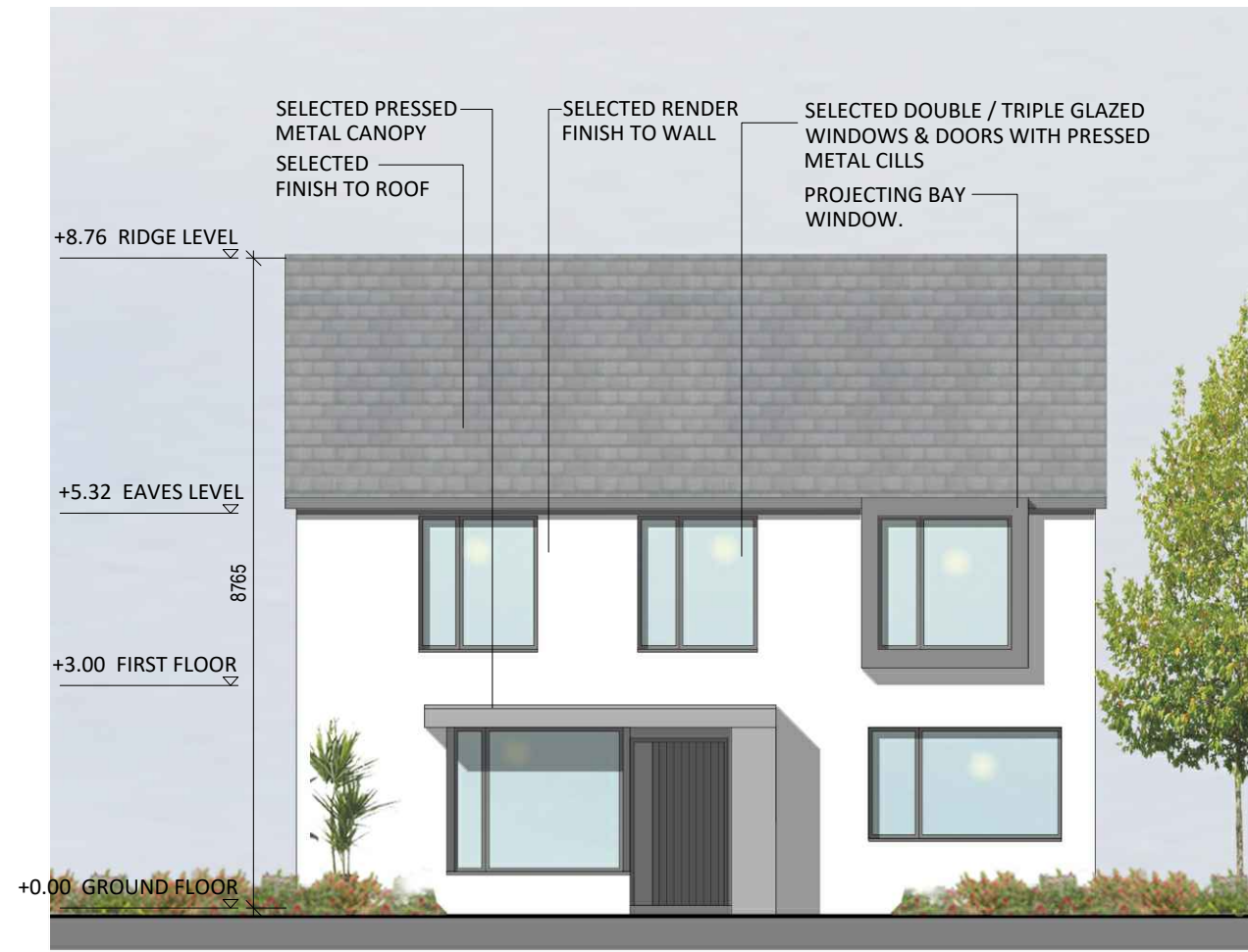
FRONT ELEVATION scale 1:100